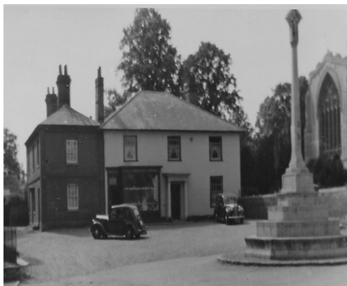
Gooch's Chemist in Royal Square in the late 1940s