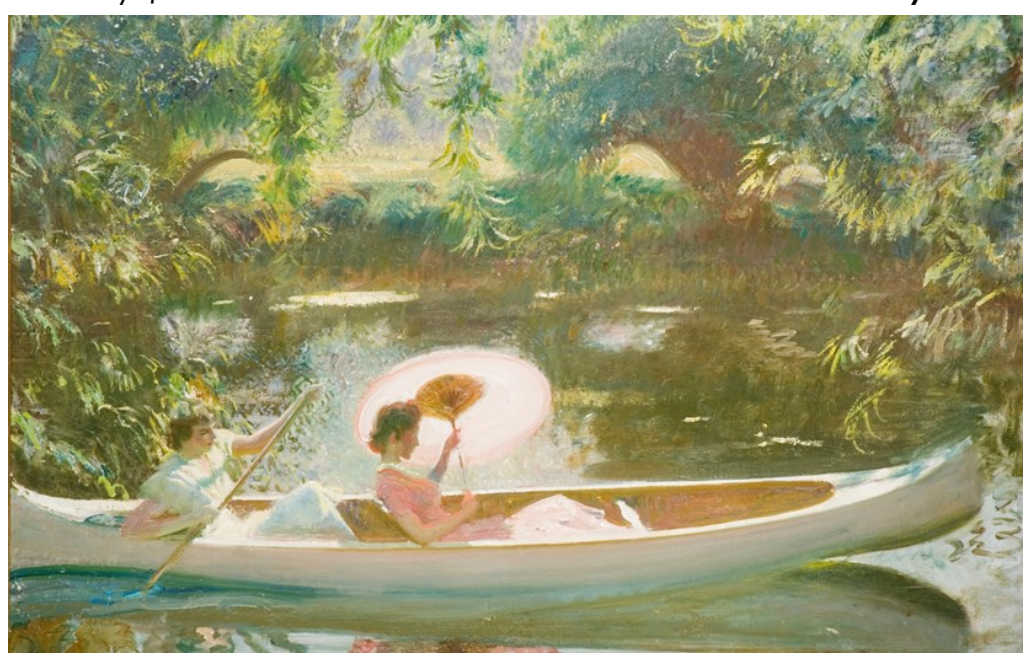
September Afternoon, 1939, by Sir Alfred Munnings Copyright the estate of Sir Alfred Munnings