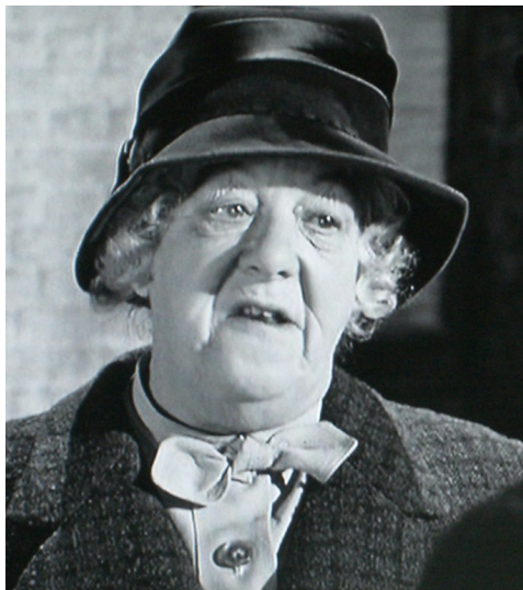
Margaret Rutherford as Miss Marple in 1963. Her friendship with Agatha Christie is dramatised on 24 Oct