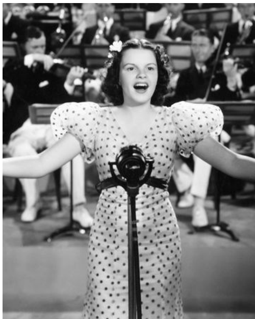
Judy Garland as she was in 1936. Her story is retold on 12 Oct