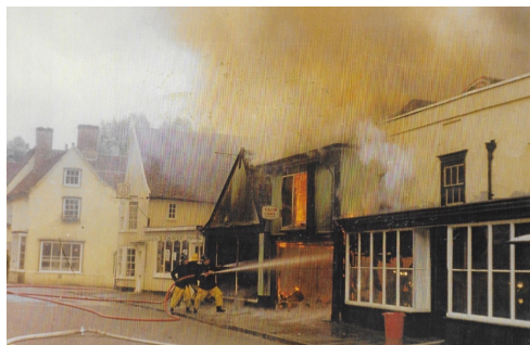
Ray's on fire, June 1976. The part with double bay windows was the former Post Office