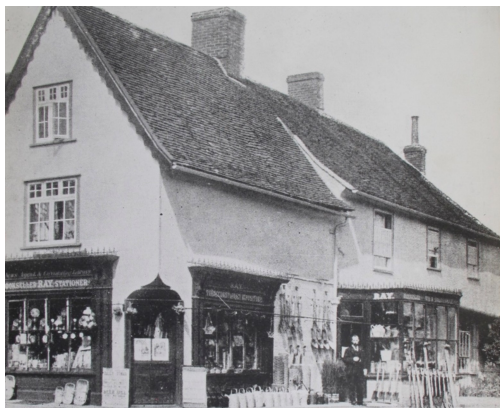
Major Charles Ray's Dedham Bazaar Established 1810, in the early 20th century

Ray's, established in 1810, was one of many Dedham shops which moved from one High Street premises to another. In the 1930s it occupied the site of the present Essex Rose tearoom on the corner of Mill Lane and was known as Major Ray's Bazaar. As was usual for shops in the village at that time, it sold a bewildering variety of merchandise, stocking everything from paint, distemper, stoves and oil lamps to gardening tools, galvanised pails, enamel jugs, clothes and footwear of all kinds including "dull rubber wellington boots at an astonishingly low price". Hardware included china plates, cups and saucers, which my parents remembered were placed on the scales and sold by weight in the 1930s. Merchandise set out on the pavement included a display of walking sticks and John Jennings told me that in those innocent days, Dedham boys would feel very daring helping themselves to a stick and walking round with it through Stratford St Mary before putting it back.