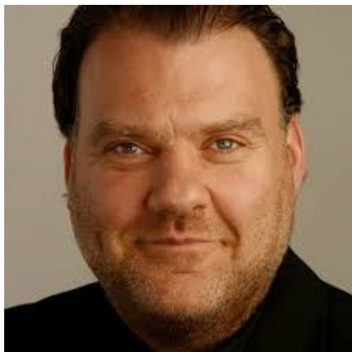
Bryn Terfel plays Don Pasquale, from the Royal Opera House – 24 Oct

Kurt Weill: The Silver Lake – a Winter's Tale 7.30 pm