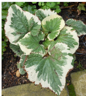
Brunnera 'Dawson's White'

So what's been a success? I'm pleased to report that Brunnera 'Dawson's White' lived up to expectations – you may remember I mentioned planting this earlier in the year as a possible replacement for the Hosta doilies!! Absolutely trouble-free, the large green and white leaves contrasted well against darker foliage and it will look even better next year as it 'clumps up' ready for dividing. Both this variety and its better-known cousin B. 'Jack Frost', are ideal for the shady border.