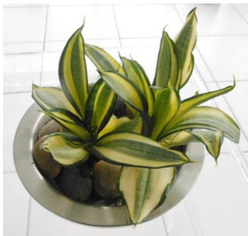
Sansevieria 'Golden Hahnii'

Surprisingly, it seems that cacti and succulents are now top of the list as the most popular houseplants (according to several social media platforms); being easy to care for, they take up little space and fit in well with modern or minimalist décor. However, I have to admit that cacti don't really fill me with enthusiasm (they are not particularly child-friendly either), but succulents do present more interest, particularly now as many have been bred to appeal to new 'buyers' interested in calm, green spaces and trouble-free plants (hardly a nasty bug in sight!).