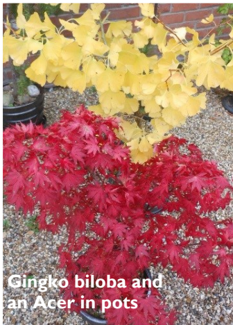
Ginkgo biloba and an Acer in pots

Unlike other Cornus varieties this one sends up new shoots underground so allow space around it for digging them out, otherwise removing them from surrounding permanent planting is difficult. But the splash of orangey-red during the winter is fantastic and a few stems in a vase will brighten up a dull corner. Dogwoods should be cut hard back in spring if you want colourful stems next year.