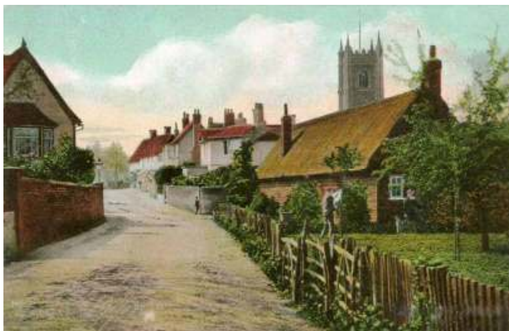
Mill Lane Looking South