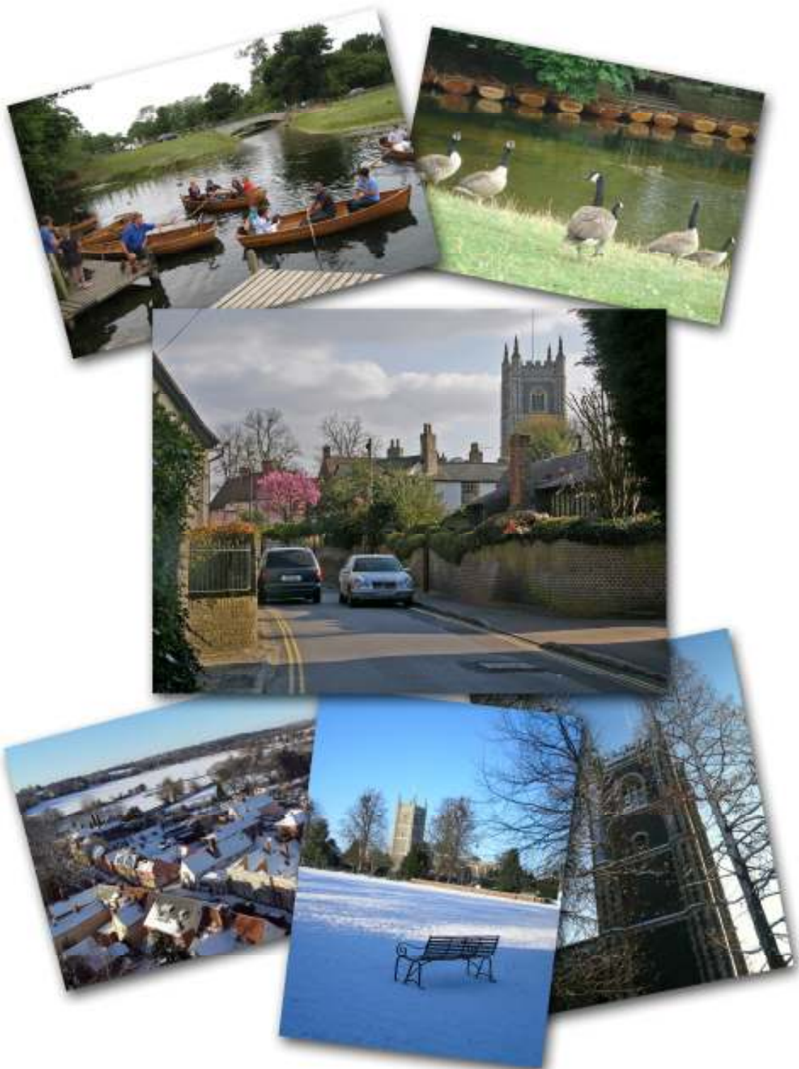
Dedham Photo Competition 2010 Finalists