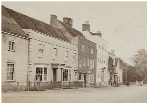
Loom House (then Church House) in the 1880s, showing its original bay windows