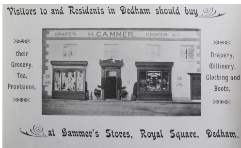
Henry Gammer's new shopfront, probably dating from 1994