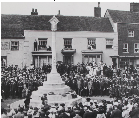
The surviving shopfront of the former Gammer's Stores, seen on the occasion of the dedication of the War Memorial in 1921