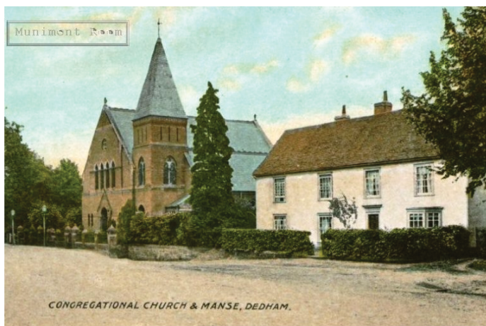
The Congregational Chapel as rebuilt in 1871 and the Manse for the Minister dating from c.1738