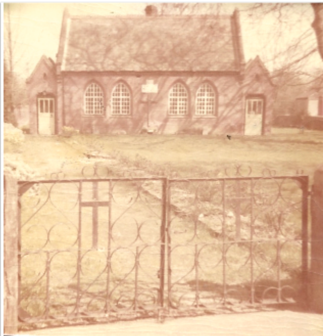
The Heath Church in 1978. Note the crucifixes in the ironwork of the gate. The tablet on the front recorded its foundation as the Heath School in 1858.