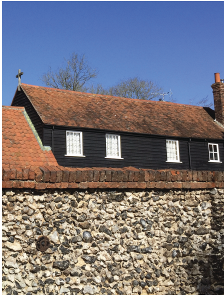
The former Roman Catholic Chapel at Upper Park which still retains the Cross on its gable end.