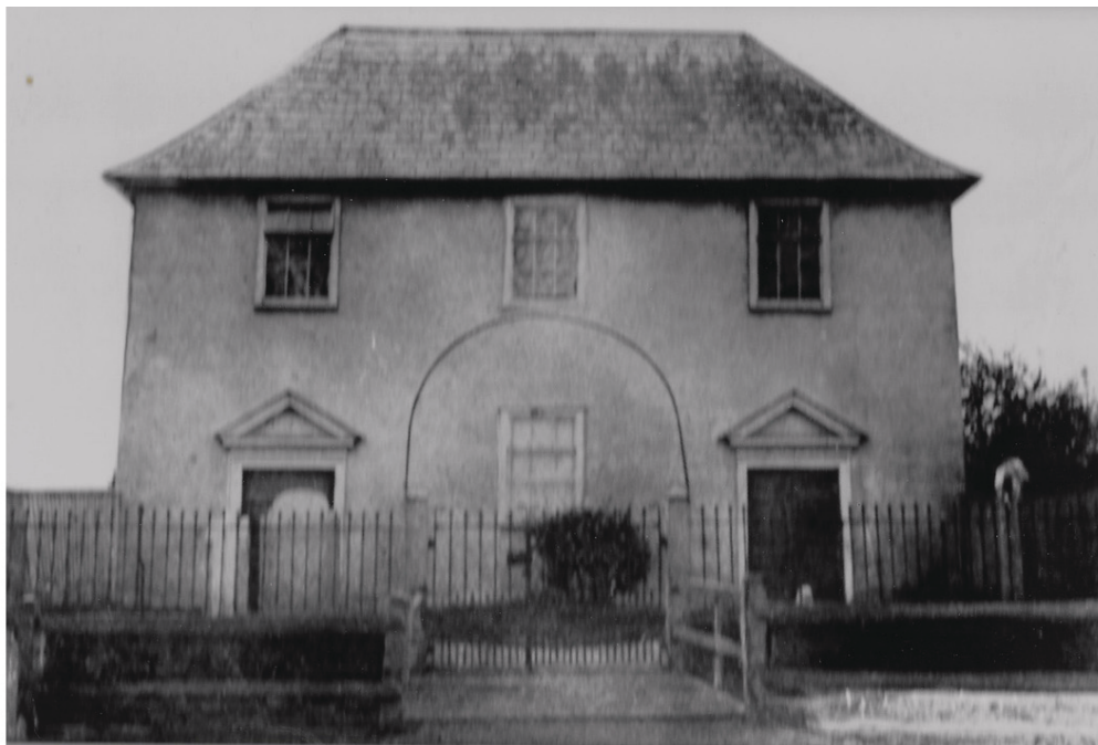
The Congregational Chapel built in 1738. Note the separate entrances for men and women