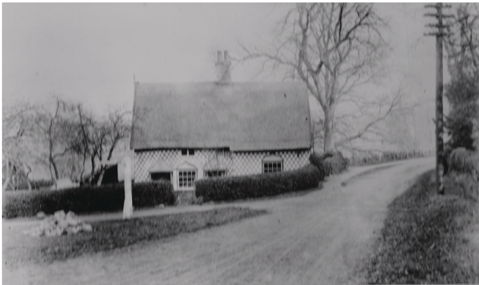
The cottage which took the place of the the Lord's Chapel at the foot of Gun Hill, photographed in the 1920's.