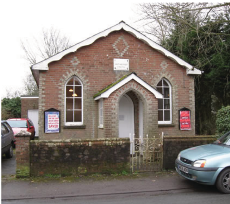
The Heath Methodist Chapel when still in use c. 2000