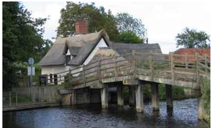
The hump back bridge, with Bridge Cottage in the background