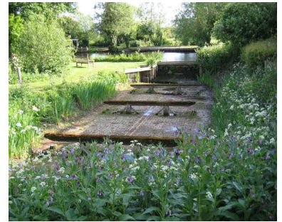
The dry dock as you will see it

John Constable, 1815.