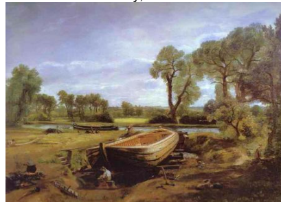
The dry dock as Constable saw it in "Boatbuilding near Flatford Mill"

John Constable, 1815.