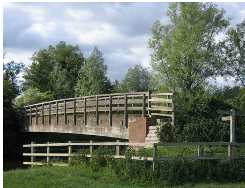
The Fen Bridge