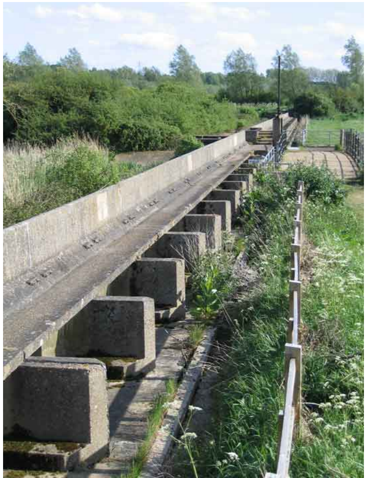
The "56 Gates"

At the "56 Gates" (concrete sluice gates built in 1947 to prevent flooding) cross a bridge over the original course of the River Stour, and follow the path south-westwards (i.e. 2.2 slightly to the right) through a field gate and then across a field that often contains cattle, until a concrete farm road is reached.