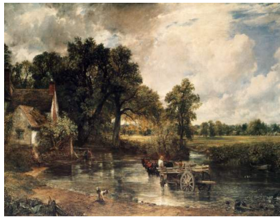
Willy Lott's Cottage as Constable saw it in "The Hay Wain"

John Constable, 1821.