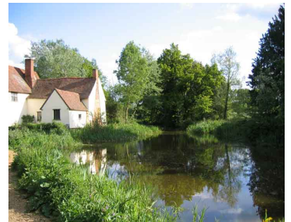
Willy Lott's Cottage as you will see it

John Constable, 1821.