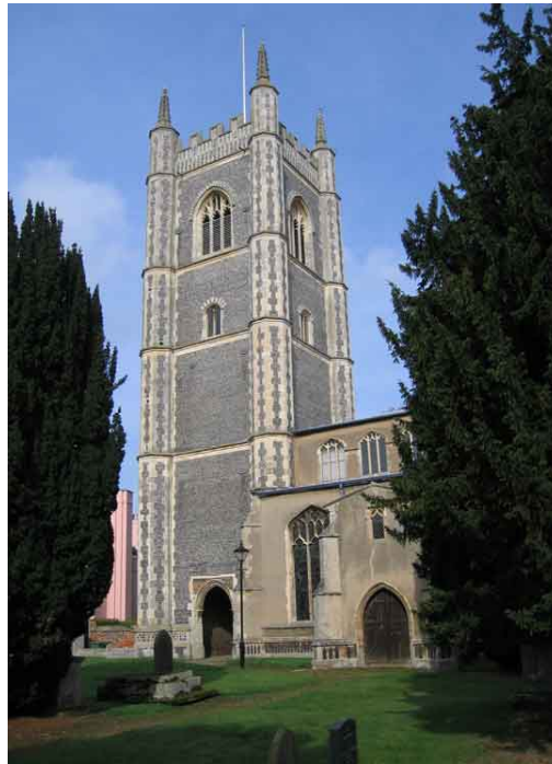
St. Mary's Church, Dedham

Pass the Fen Bridge. (This is a replica of the one that would have been used by John Constable on his way to and from school, and was lifted into place by a Chinook helicopter in 1985.) 0.8